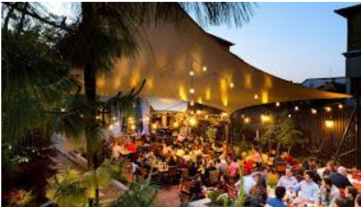
Welcome Reception at: Grădina Restaurant , Victoriei Boulevard, No. 34, Sibiu.